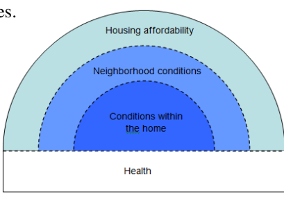
Figure 1. Housing influences health in many ways.

Most Americans spend about 90 percent of their time indoors, and an estimated two-thirds of that time is spent in the home.<sup>1</sup> Very young children spend even more time at home<sup>2</sup> and are especially vulnerable to household hazards.