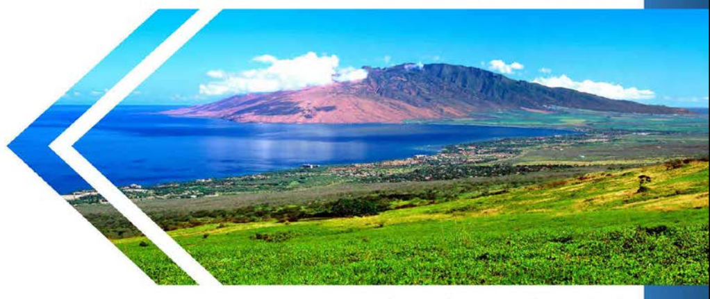
Released December 2016