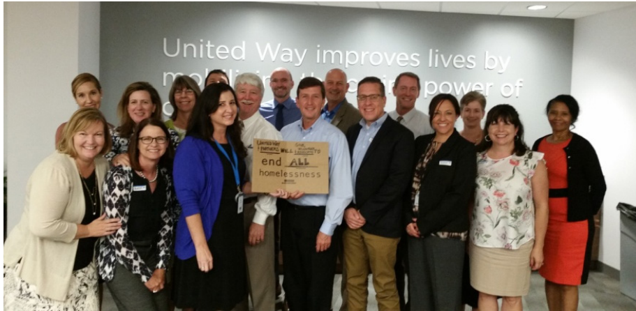
Arizona Housing Alliance is a partner in the Valley of the Sun Ending Homelessness Advisory Council.