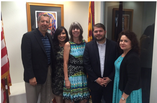
Arizona Housing Alliance Board members meet with Congressman Ruben Gallegos.